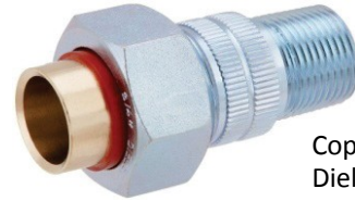
Copper x Male Dielectric Union