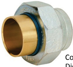
Copper x Female Dielectric Union